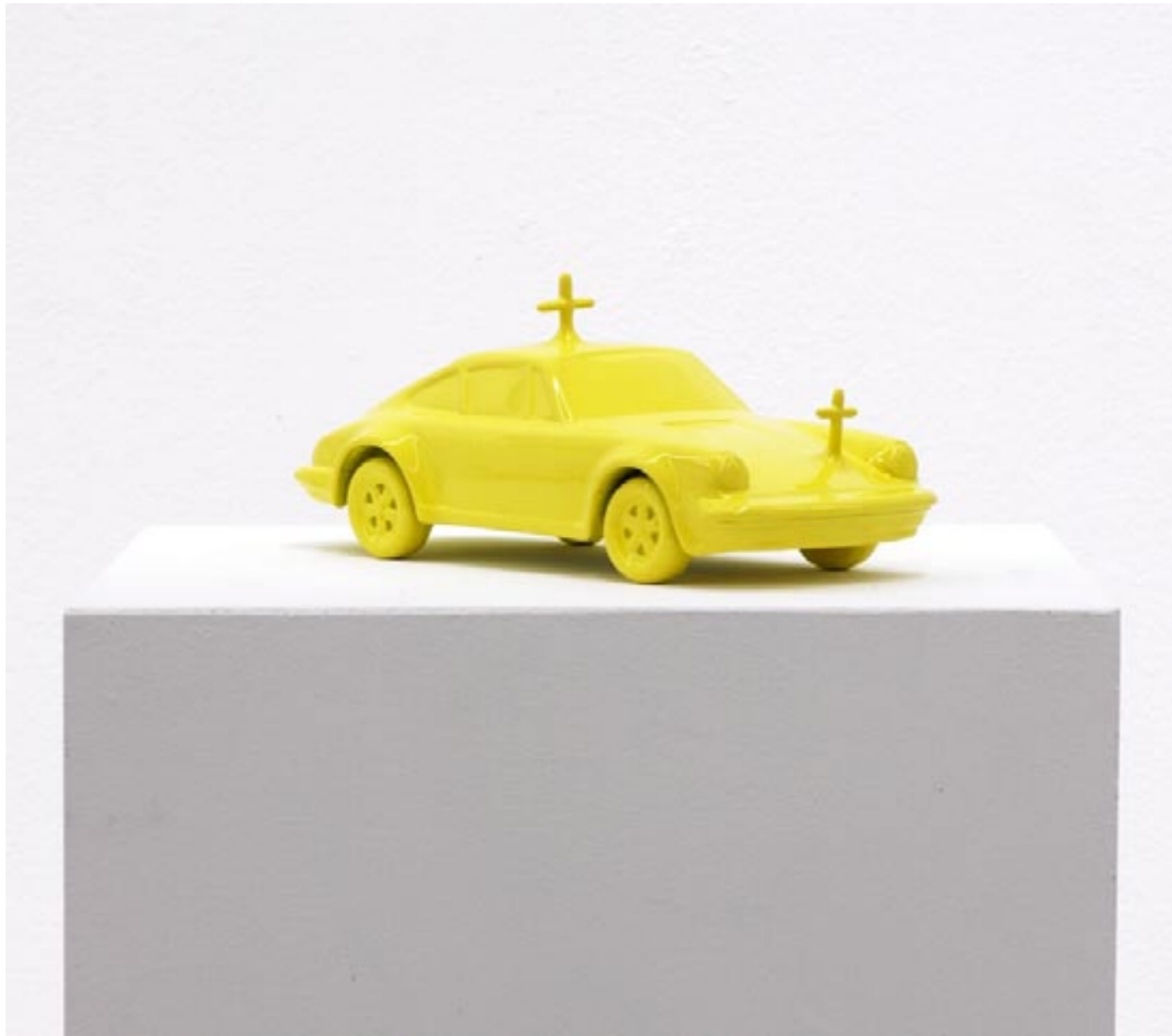
(hip hop porsche), 2006, plaster, paint, varnish, 4.7" x 10.5" x 4.7"