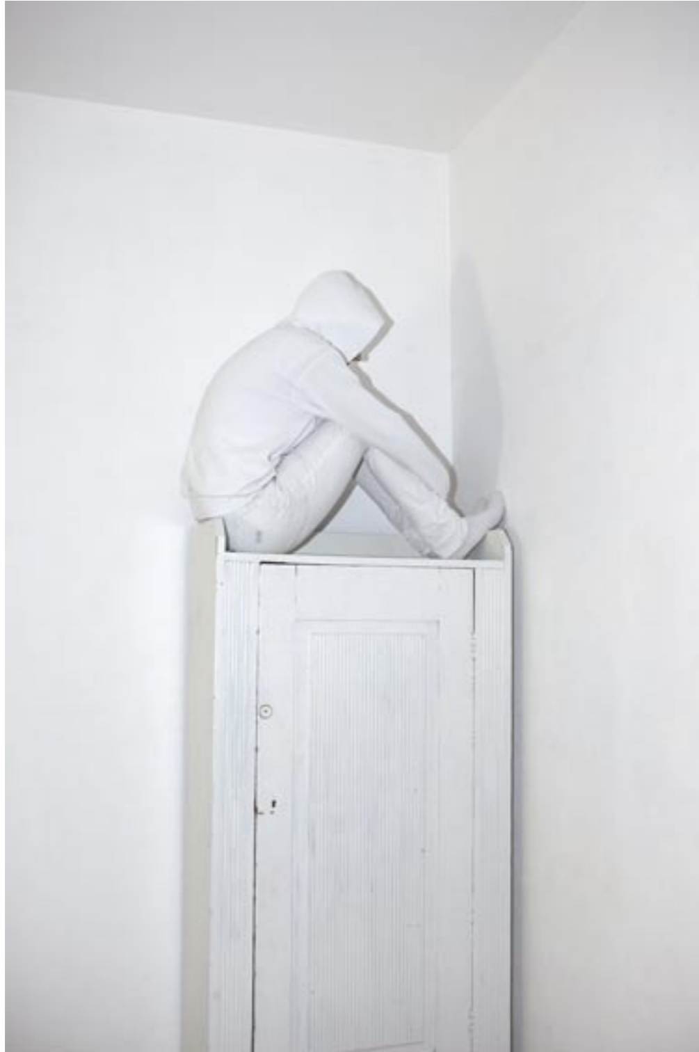
From the series "I want to live an invisible life".