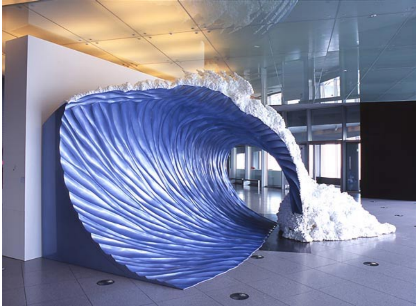
The BIG TIME 2005, fiberglass, wood, polyurethane, automotive paint, 350 x 500 x 400 cm