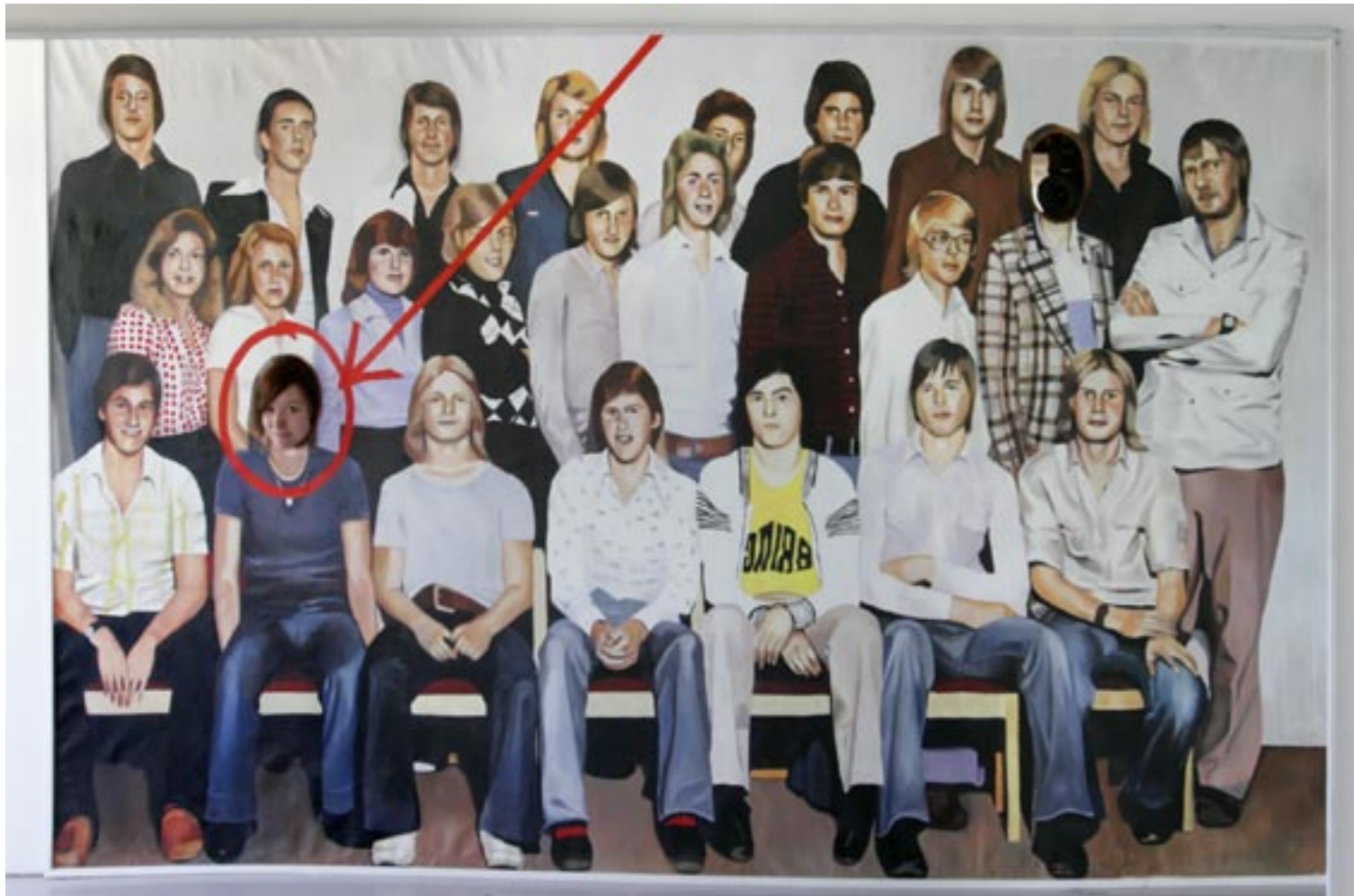
"Raseri", Rage, Raivo. 2007 Installation, oil on canvas, Mirror wall.