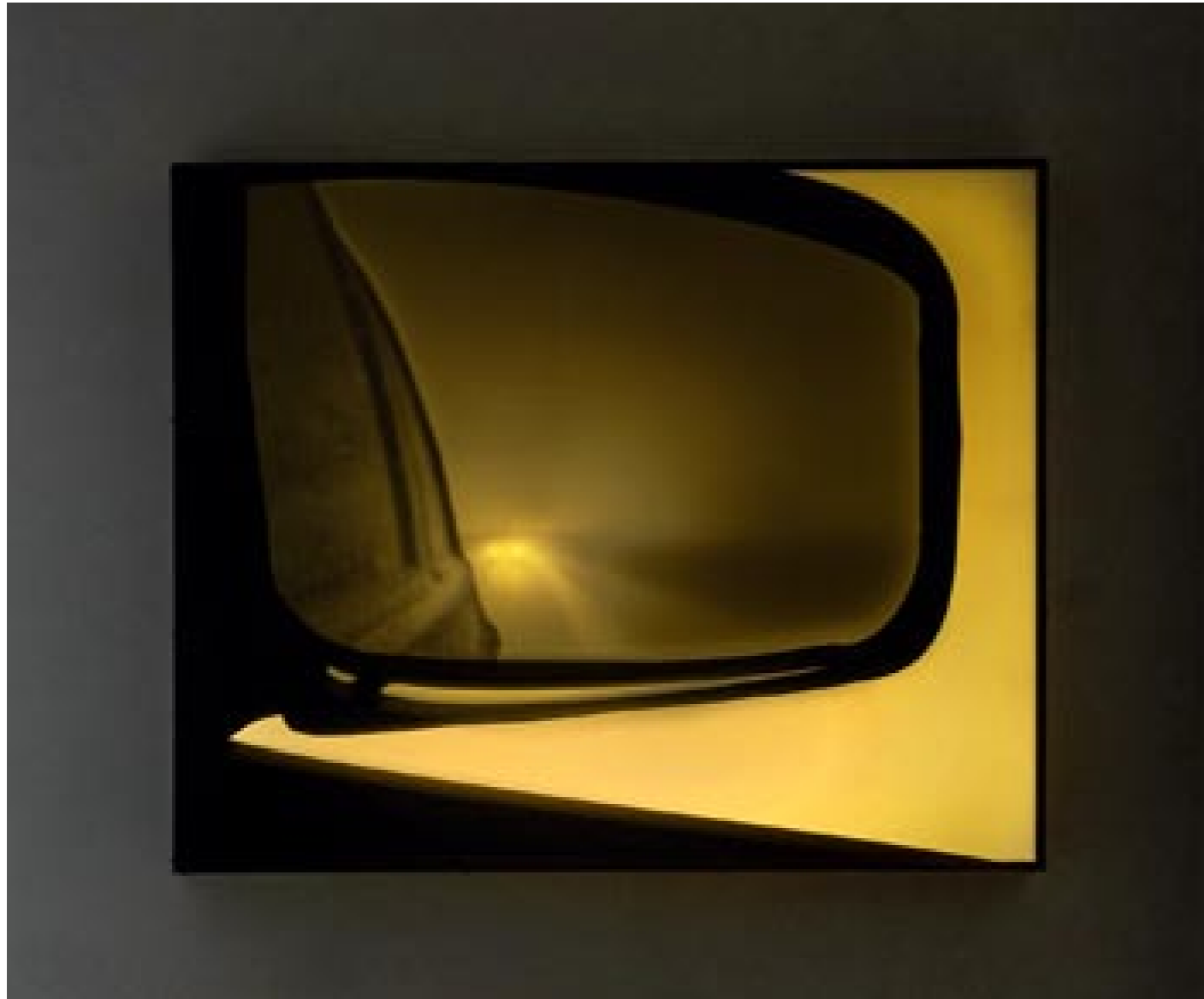
"HEAT". 2007. Sticker, light, acrylic, dc-motor, iron wire, uv-print & aluminium 140 cm x 170 cm