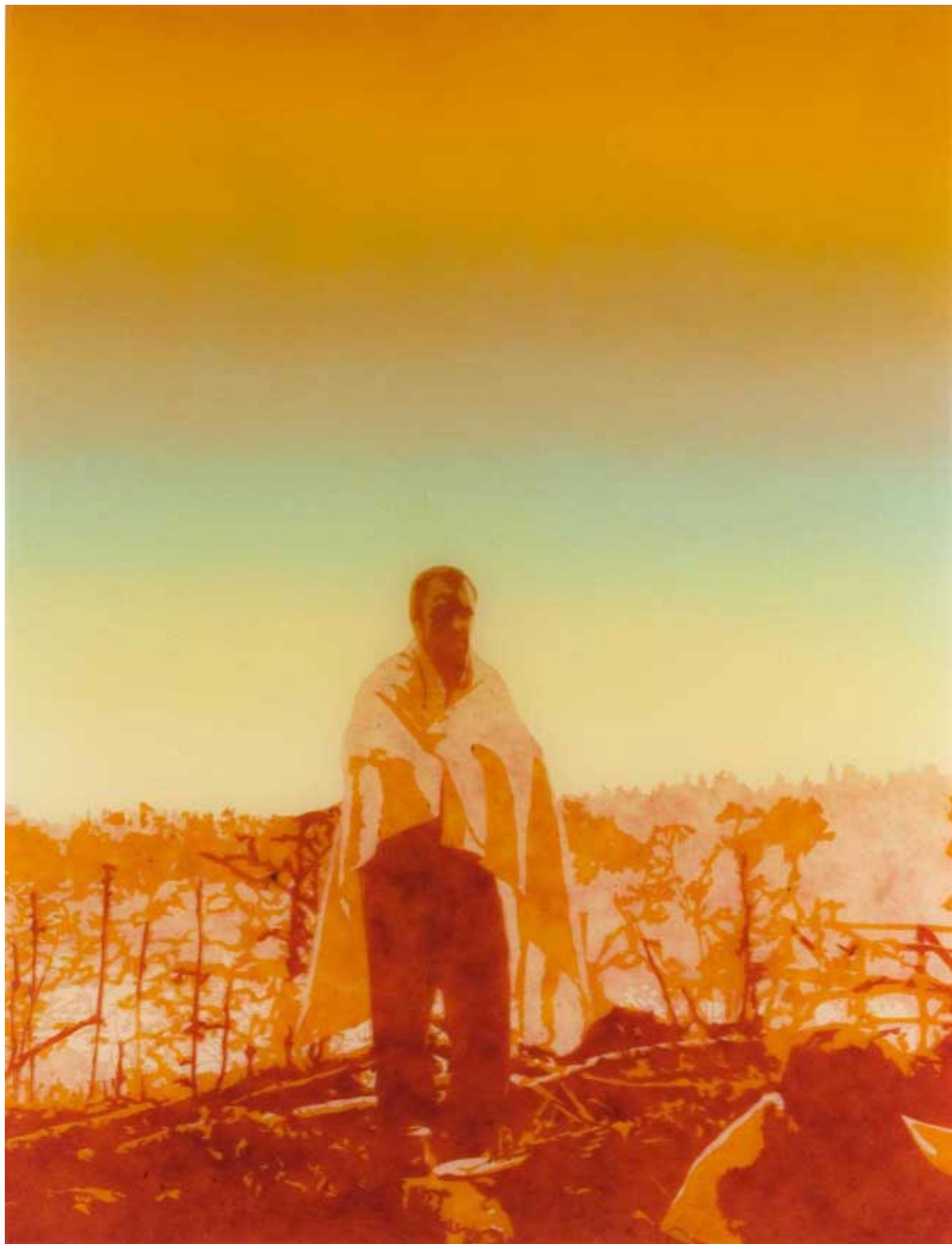
Ikaros—Aeroman, 2006, spray, papercut & varnish on mdf-board, 79 x 61 cm